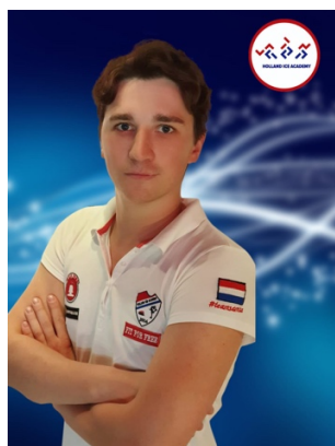
Mikaylov Nikita (RUS)

is a Russian figure skater. He is the 2011 World bronze medalist, the 2012 European silver medalist, the 2010 World Junior bronze medalist, and a Two-time Russian national silver medalist.