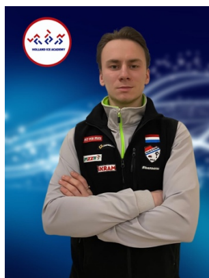
Artur Andreyevich Gachinski (RUS)